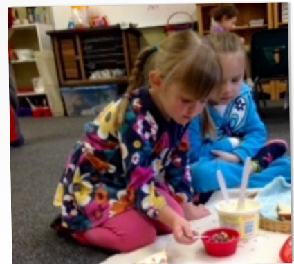
AUSSIE FAIRY BREAD